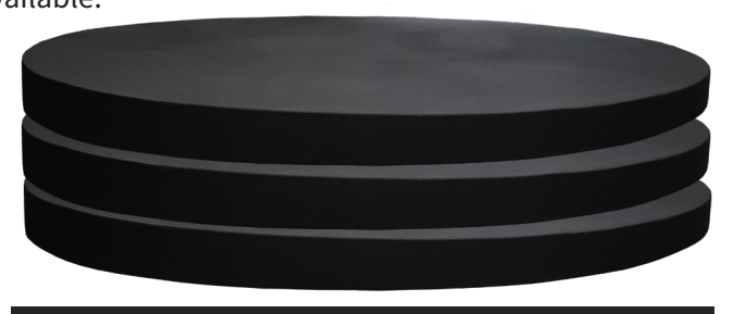
SLOPED TANK BASES

Dragon Jacket Insulation's Industrial Tank Bases are modular bases engineered for use with any above ground storage tank. Each base is fully encapsulated with a moisture impermeable and chemical resistant barrier which eliminates corrosive properties leading to CUI and drastically increases the lifespan of the tank. Both flat and sloped bases are available.