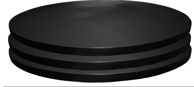
FLAT TANK BASES