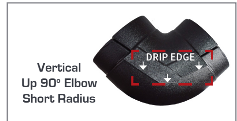
Vertical Up 90° Elbow Short Radius