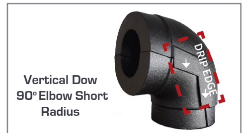
Vertical Dow 90° Elbow Short Radius