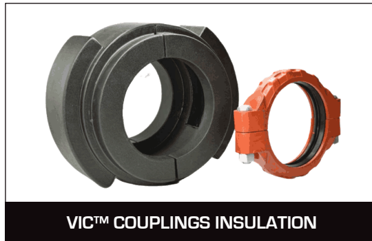
VIC™ COUPLINGS INSULATION