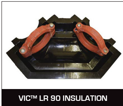
VIC™ LR 90 INSULATION

✓ 100% WATERPROOF ✓ CHEMICAL RESISTANT ✓ MITIGATES CUI ✓ 20+ YEAR LIFESPAN