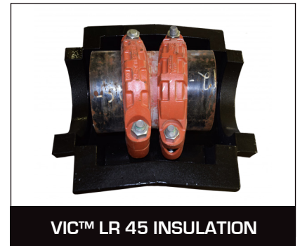
VIC™ LR 45 INSULATION